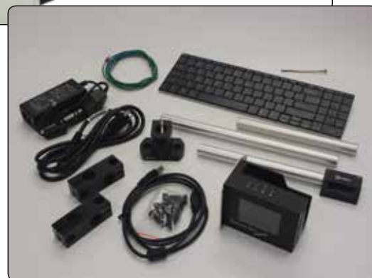
Pieces included in package