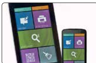
App works on Android devices