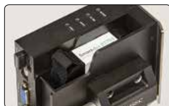
Slim Print Head