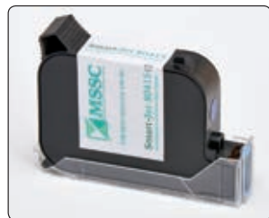
HP TIJ 2.5 technology